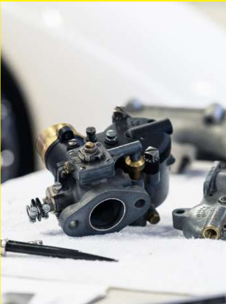
The team at RPG initially printed the replacement part in Onyx, and then printed it in 17-4 PH Stainless Steel.