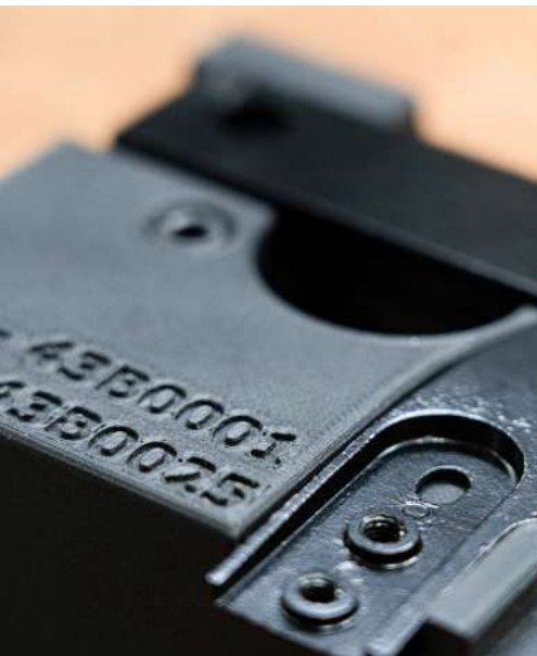
Custom assembly fixture

Caldwell has well and truly integrated 3D printing into everything, from R&D, robotic parts for testing, assembly fixtures, tooling, all the way to post-processed parts for customers. The team 3D prints tooling for the shop floor, and the assemblers can provide feedback and suggestions for improvement. “If an assembler feels like there’s a change that needs to be made, I have no hesitation making a change,” says Manufacturing Engineer Phillip Cole. “We quickly make a design change, send it to the printer, and swap it out.” What used to take 6-12 months to do now takes the team 6-12 days, thanks to the carbon fiber 3D printer.