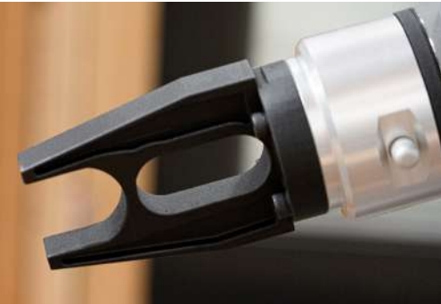
The company has printed end effectors for their robots to conduct numerous tests