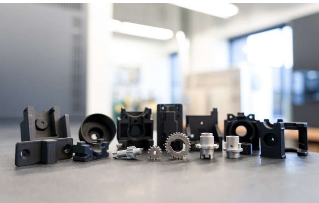
3D printed metal and carbon fiber components for R&D testing.